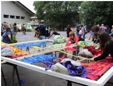
La Piana, Milan