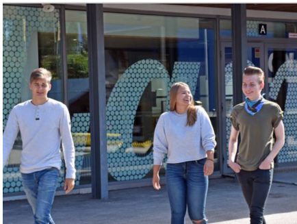
School as a Service, Helsinki

Aalto University, Helsinki, Finland