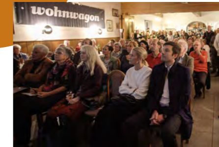
An information event in the rooms of the Dorfschmiede