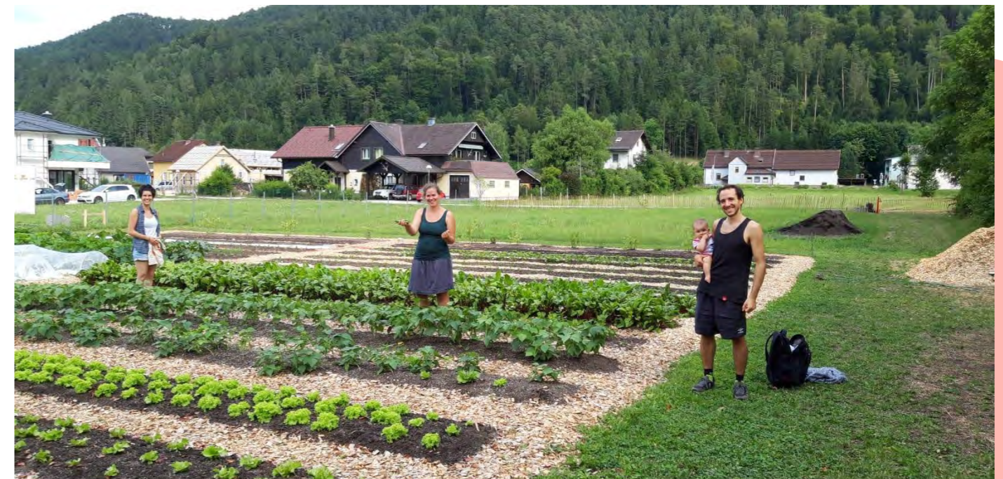
Biologically dynamic vegetables from the garden farm are used in the kitchen of the Dorfschmiede.