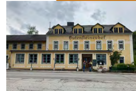
Graz Dorfschmiede