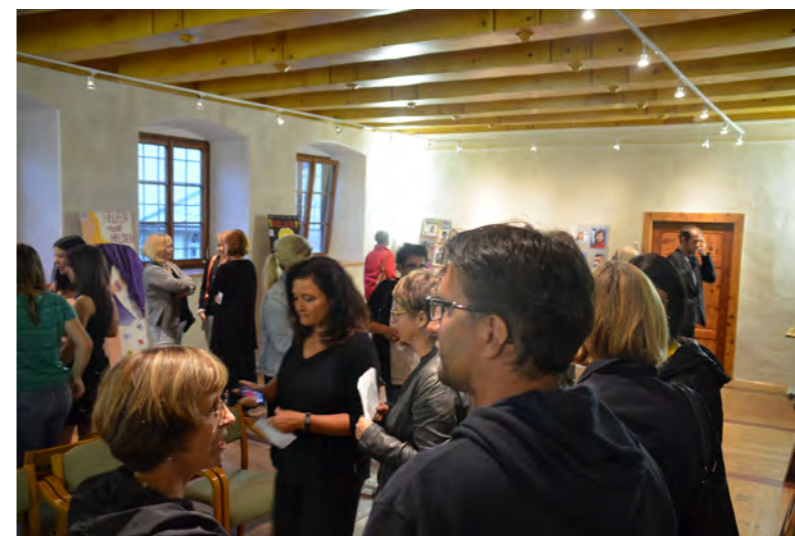
MurauerInnen, Heldinnen May 2020