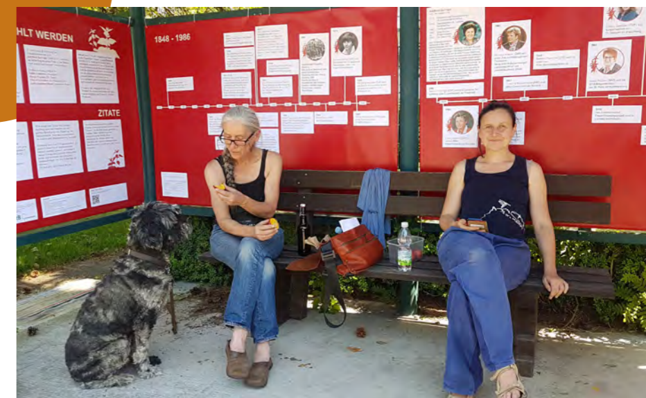
Busstop, 2021 June 17th