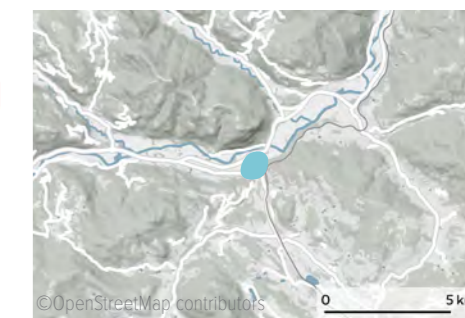
Murau, Styria, Austria