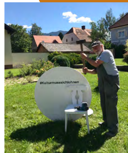
Kultur muss sich lohnen

STUBENrein seems to have reached its targeted impacts. The local community has been truly involved and new dynamics have emerged. Moreover, politically, socially and culturally well-trodden paths were broken up. However, some projects did not work out the needs of the population. That is the case of some podcasts because apparently the need to come together in real space is too strong. The beneficiaries of this project are probably those who are currently not sufficiently represented in general social life, such as part-time farmers, young women-farmers, the socially disadvantaged, ... More broadly, we can say that these activities have been well perceived by users and this should lead to local follow-up events.