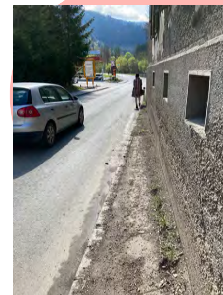
Street without sidewalk