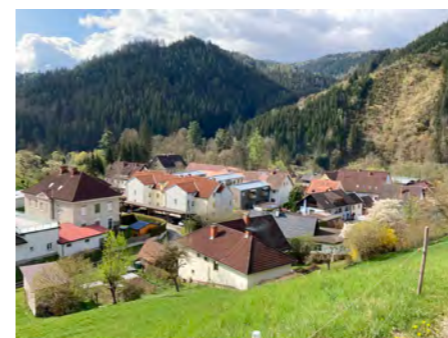
Village of Stanz