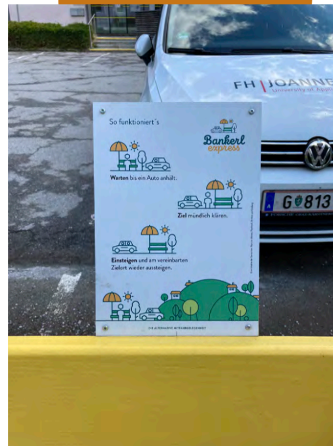
Description benches

The project was conceived by a citizens initiative , originally created to prevent the amalgamation of municipalities in Styria. One of