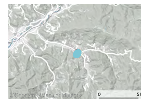
Stanz in the Mürz valley, Styria, Austria