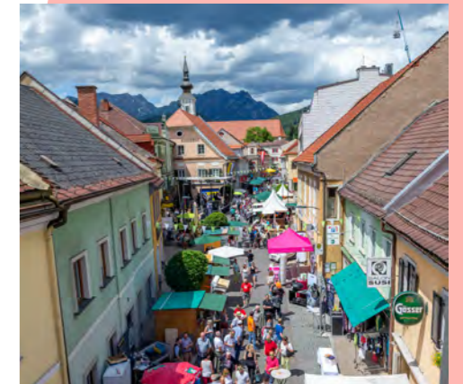
Since 2016, Trofaiach has held an annual street festival in the Main Street.