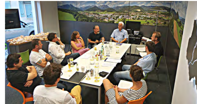
Participation meeting with nonconform, citizens and community representatives.