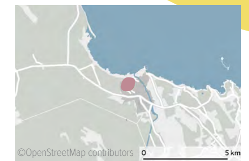
Kärdla, Hiiumaa, Estonia