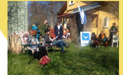
Garden party