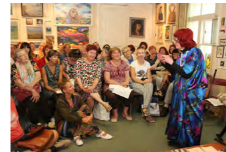
Gathering of Estonian language teachers