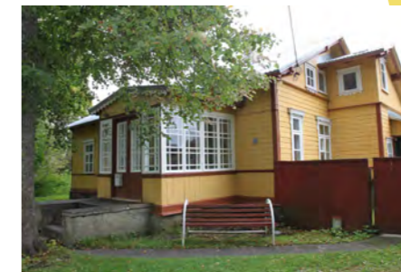
Ave Vita! Centre for cultural activities