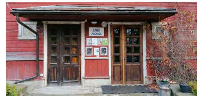
Sign of old elementary school, now a village society