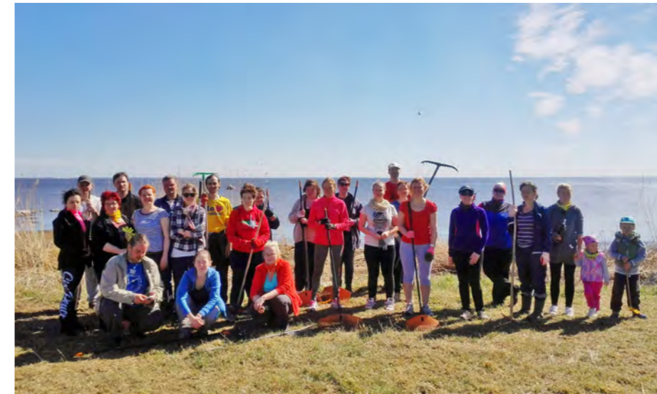
Joint activity

Under the leadership of the village society, a beautiful sound chamber and a village swing have been built there and a bridge has been completed . The traditional co-organized annual Midsummer celebrations take place every year. With the locals, the village society works to make the Lindi area an open community where each member feels the impact of their thoughts, concerns and words, appreciates the power of unity and values a pleasant environment. The local community is actively participating in these activities. They are co-organizing, taking part and helping. One of the Village society's core values has been to