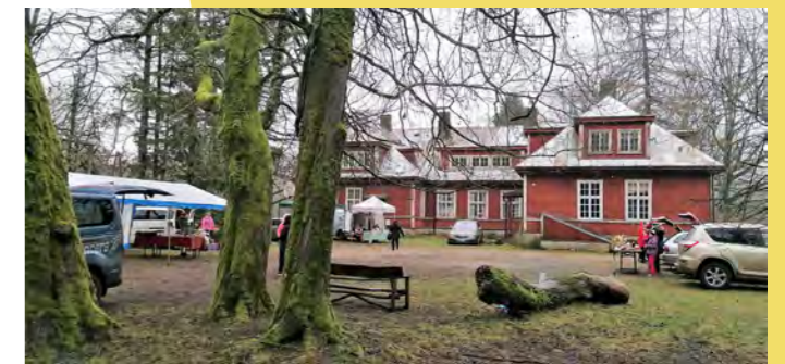
Old school, now a community center/village society