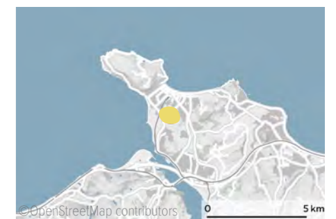
Llandudno, Wales, United Kingdom - Wales