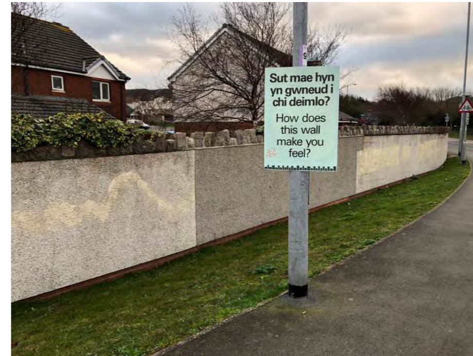
Interactive walking tour around estate

In addition to general support, advice and guidance from community organisations such