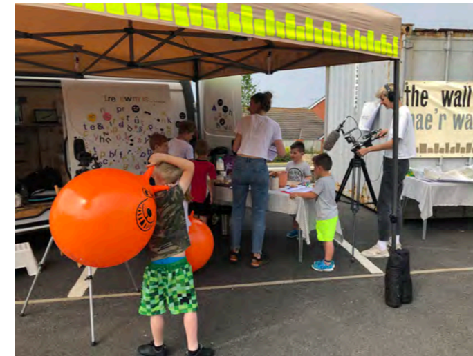
Getting to know you van stops