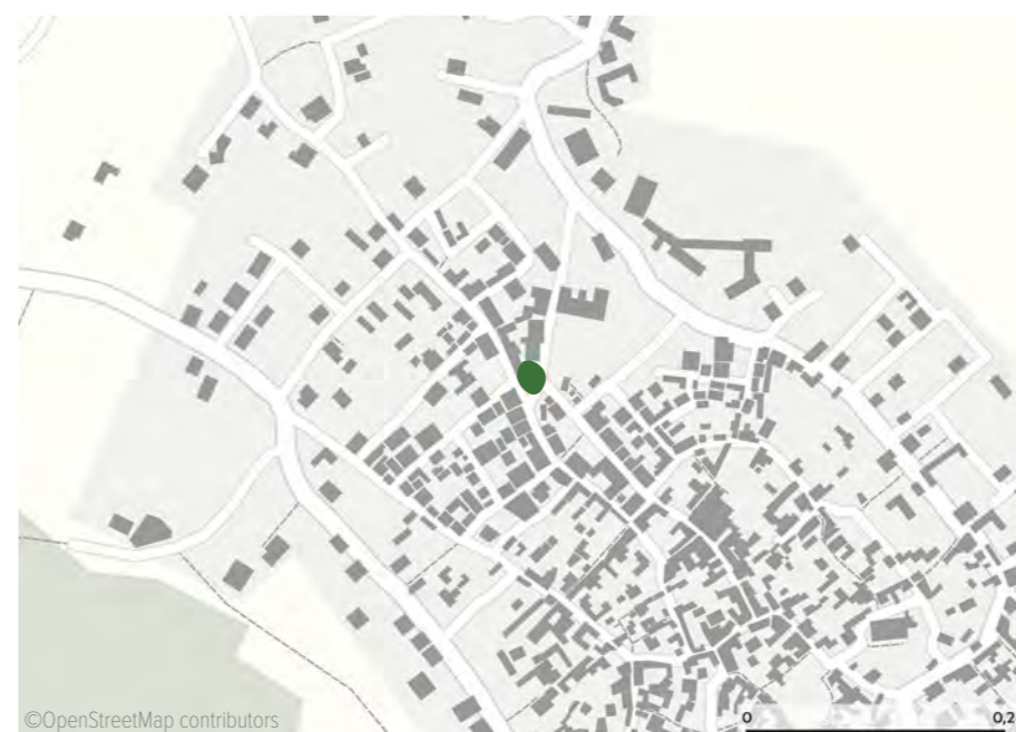
Pyrgos, Tinos, Greece