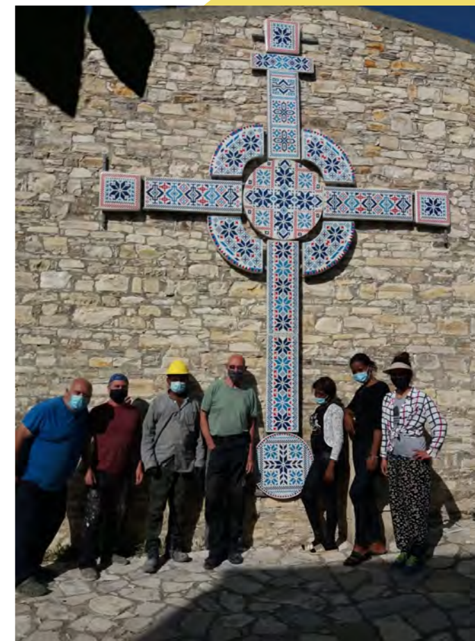
Church with a cross bearing the 'lefkatiotika' lace patterns