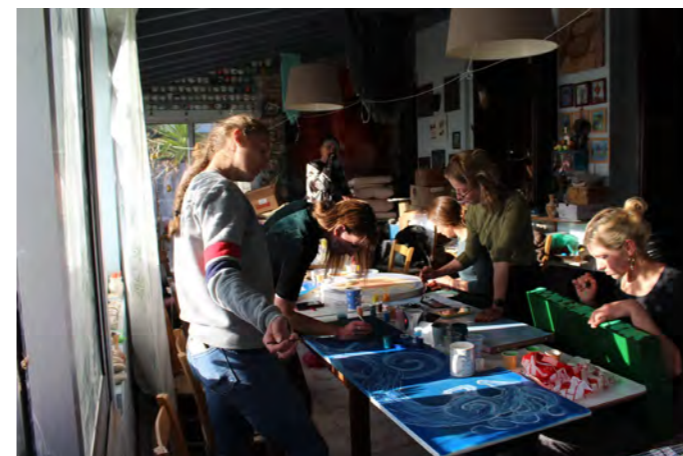
Painting lessons

The project was initiated by Grampus Heritage and Training , which is a not-for-profit organization passionate about culture, heritage and environment.