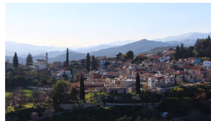
Overview of the village