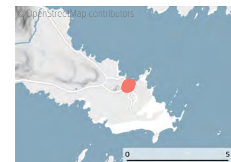
Djúpivogur, Municipality of Múlaþing, Iceland