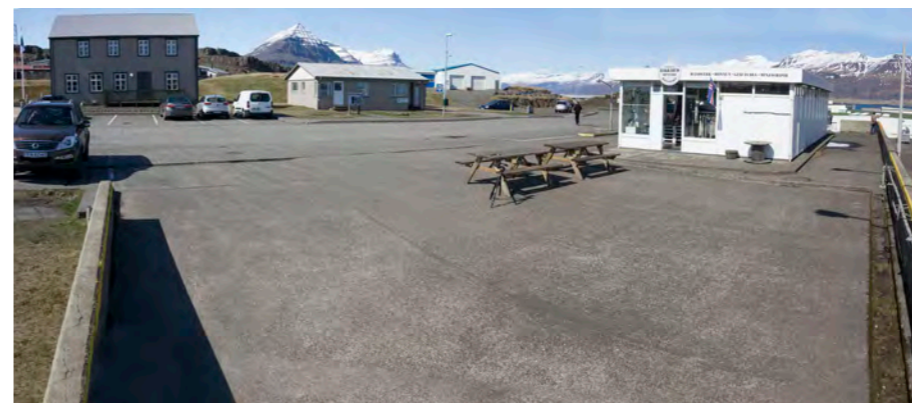
View before intervention B1

The project was initiated by the municipality of Djúpivogur in order to have better urban planning in