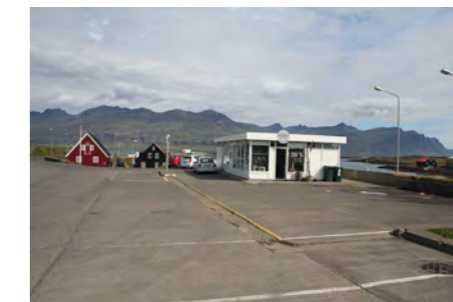
Kallabakki before the change