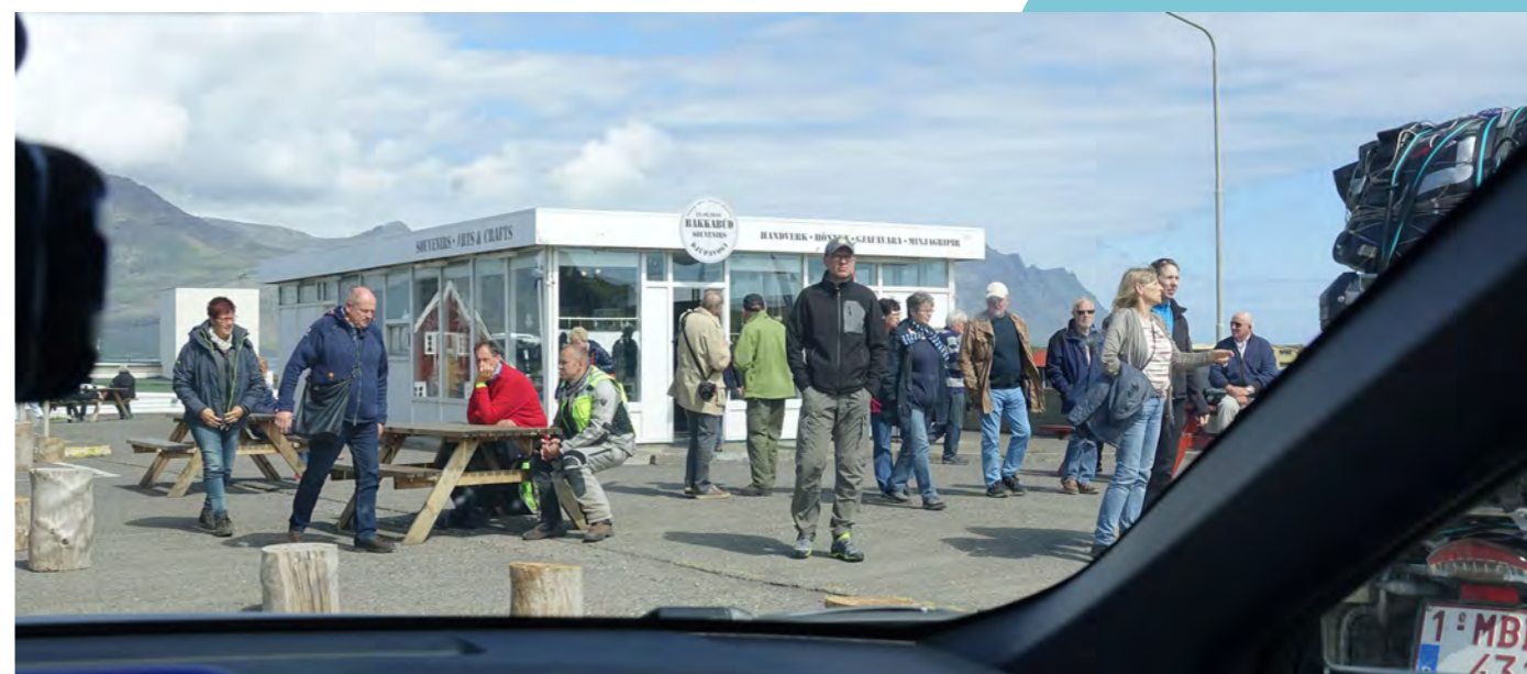
Kallabakki full of people