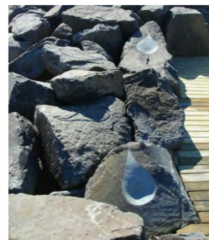
Part of the artwork which is embedded in the surrounding rocks_Samper Mireya ©Mireya Samper - photo by Júlí