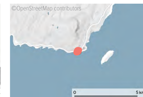
Drangsnæs, Westfjords, Iceland