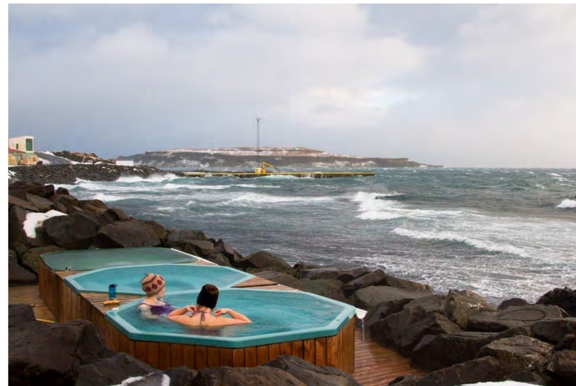
People in the hot pots on a windy day

With almost 25 years of hindsight, it seems that the project has exceeded its initial goals which were to make use of the hot water and create a pleasant place in the village. The “Hot Tub Trio” has indeed brought the community closer, attracted visitors and encouraged communication between tourists and locals. Consequently, there are numerous beneficiaries of the project, from the local fishermen, who can enjoy the tubs after they come home from the sea, to the local businesses which have benefited from the increased attractiveness of the village.