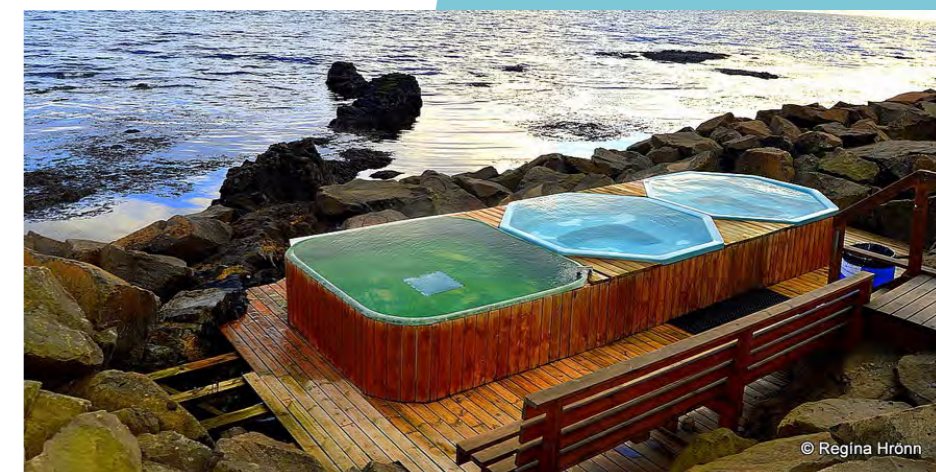
The hot pots