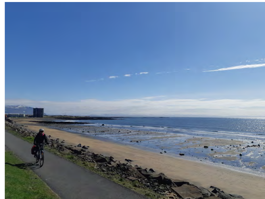
Seaside walkpath

The project reached its two main targets. In fact, this public space has become a landmark in Akranes for outdoor activities and the municipality has attracted more and more tourists. This is particularly striking since the implementation of the pool Guðlaug which attracted 30.000 visitors in 2018. With this reinforced touristic attraction and these new public facilities, it seems obvious that the local community is the main beneficiary of the project. As written in the papers Akranes.is and Skessuhorn.is, locals are generally happy with it (especially the geothermal pool) and some are fascinated by Langisandur and think of it as one of Akranes' pearls.