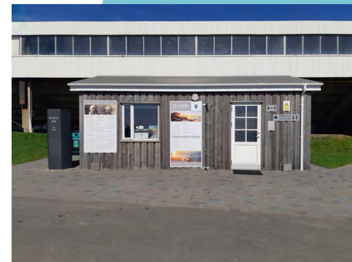
Office ©Astrid LeLarge