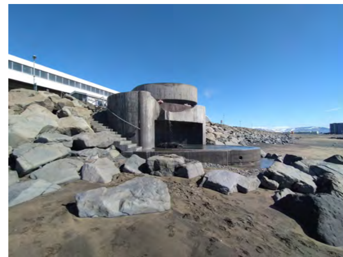
Artificial beach pools