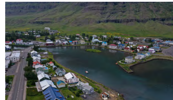
Destination Austurland