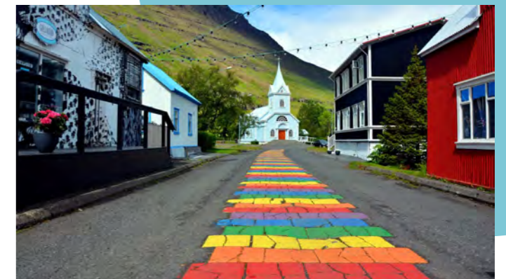
Destination Austurland