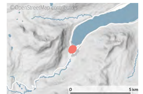
Seyðisfjörður, Mulathing, Iceland