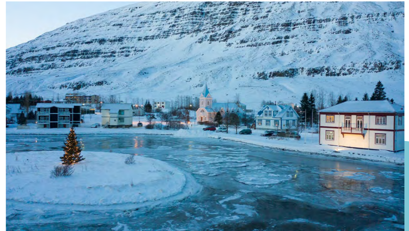
Destination Austurland