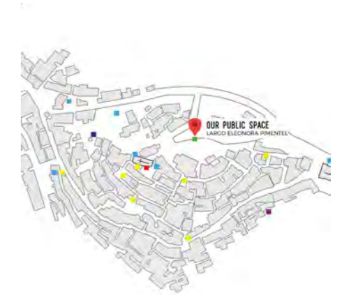
Map of "A Cielo Aperto" permanent works with the focus on the place where Latronico Flag has been displayed. ©Pasquale Campanella