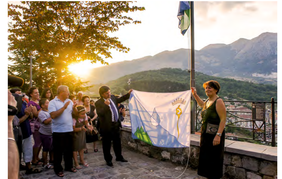
The raising of the winning flag in Largo Eleonora Pimentel in Latronico