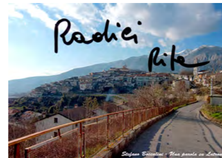
Stefano Boccalini's postcard sent to collect the words for Latronico. ©Stefano Boccalini, Una parola su Latronico, 2011