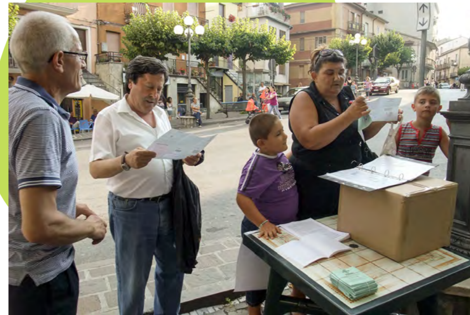
One of the polling stations where locals have been invited to vote for the flag for the town of Latronico

In the beginning, many struggled to understand the project, and it took several years for locals to become familiar with its concept. However, thanks to discovering their cultural heritage through creative works, the local community's perception has changed over the years.