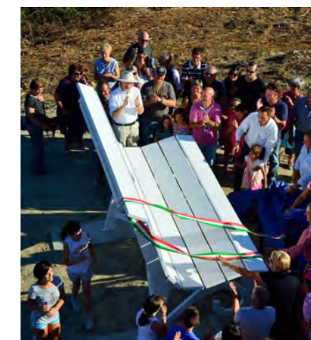
Vezza D'Alba town_Big Bench inauguration with mr. Chris Bangle and authorities of Piedmont region and Vezza d'Alba town