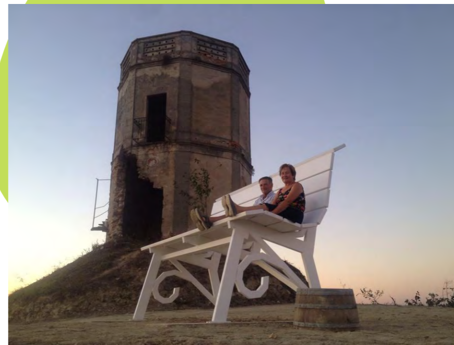
Vezza D'Alba town_People sitting on the White Big Bench next to the "Torion"

The initiative for the construction of the "White Big Bench" has been led by the Association of Merchants and Entrepreneurs of Vezza d'Alba, who wanted to set up a big bench