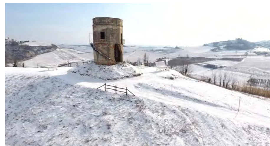
Vezza D'Alba town_The space where the White Big Bench is located, next to the "Torion", covered with snow (aerial image - drone)