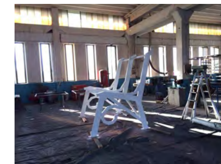
Vezza D'Alba town_Big Bench under construction