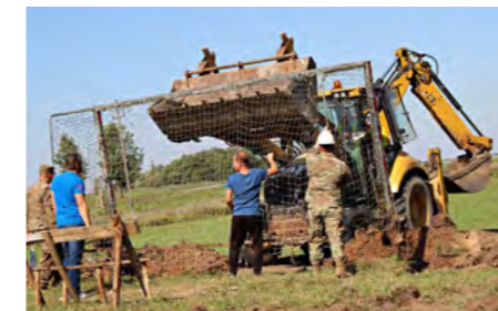
The residents activities