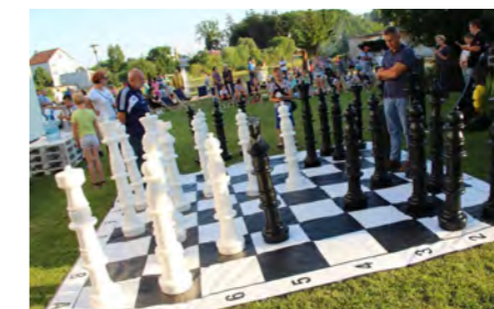
The residents activities