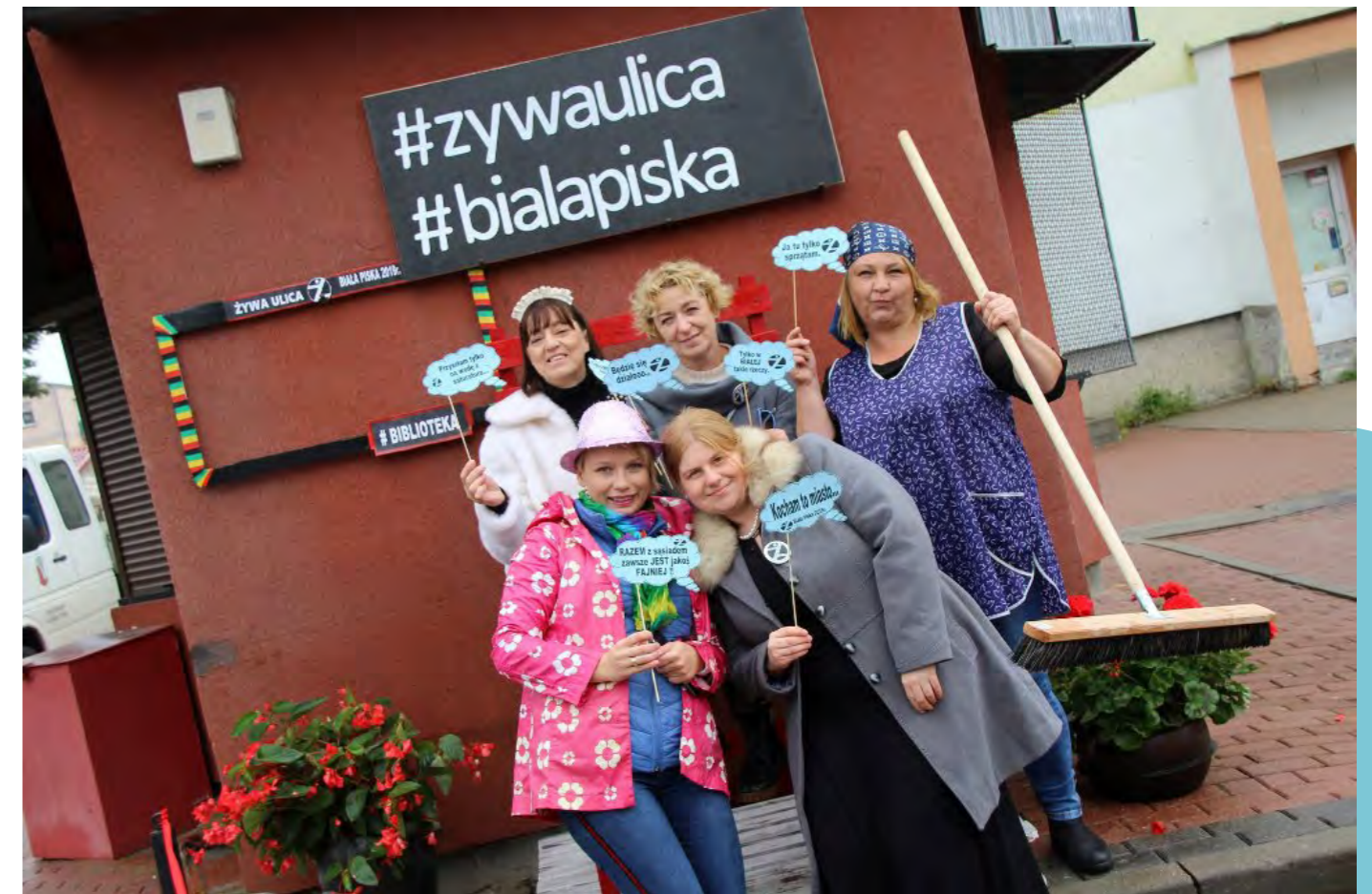
Livable Street event

The project was launched with the help of local institutions. Apart from the support of the officials, we need to point out the role of the library and cultural centre staff as