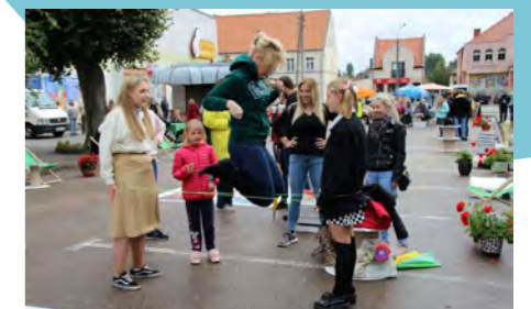
Livable Street event