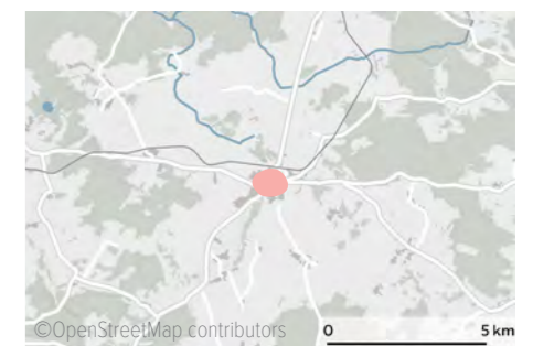
Biała Piska, Waria Masuria, Poland