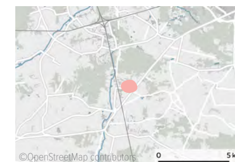
Grójec, Mazovia, Poland