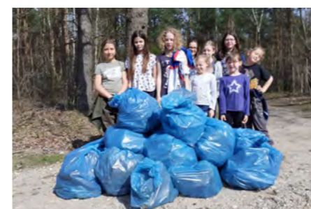
Grójec Free School - cleaning the forest