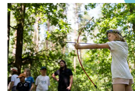
Grójec Free School - Summer Camp