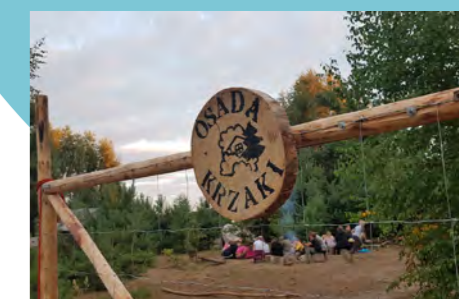
Grójec Free School - outdoor learning