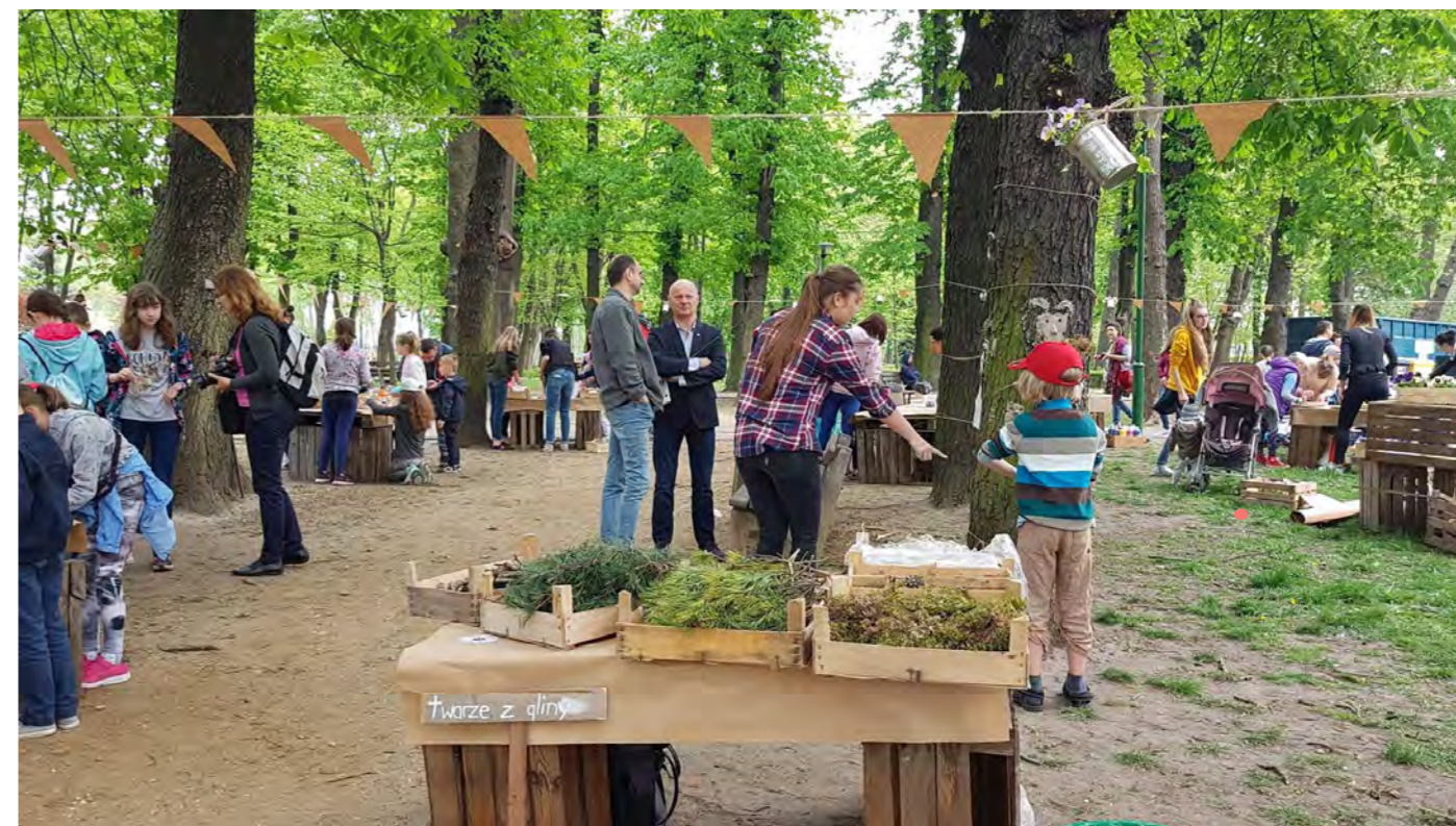
The Earth Day in Grójec

The project was created and coordinated by Fundacja Tropy Przyrody (Nature Trail Foundation). This organization wanted to