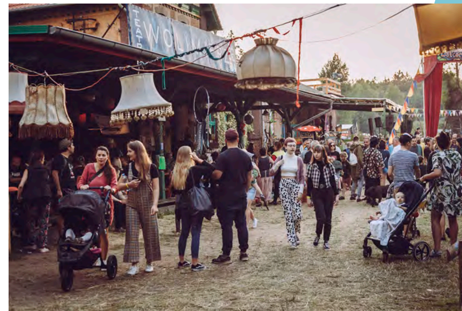
Wolimierz festival 2020