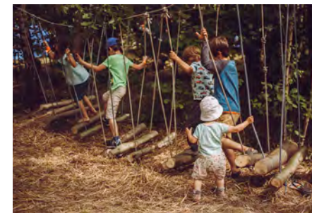
Wolimierz festival 2020

For more than twenty years, the project has been mainly operated by a group of artists and friends known as the "Klinika Lalek" puppet theatre . This group of artists has saved the buildings from