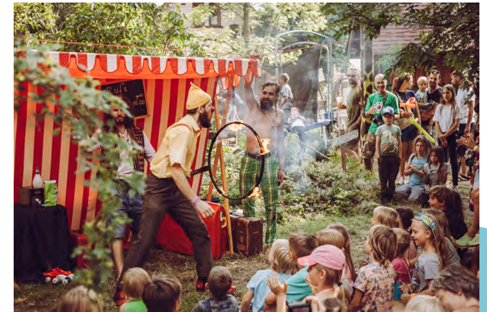
Wolimierz festival 2020