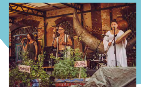
Wolimierz festival 2020