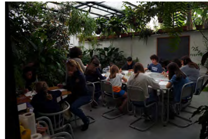
Drawing exercises with Luísa Spínola