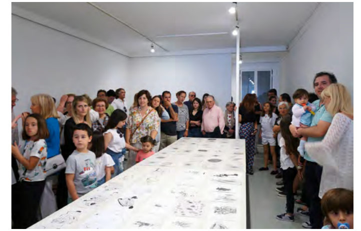
Exhibition opening