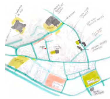
Figure-ground plan of network of public spaces in Funchal. The image represents a portion of São Pedro parish where PORTA33 is inserted.