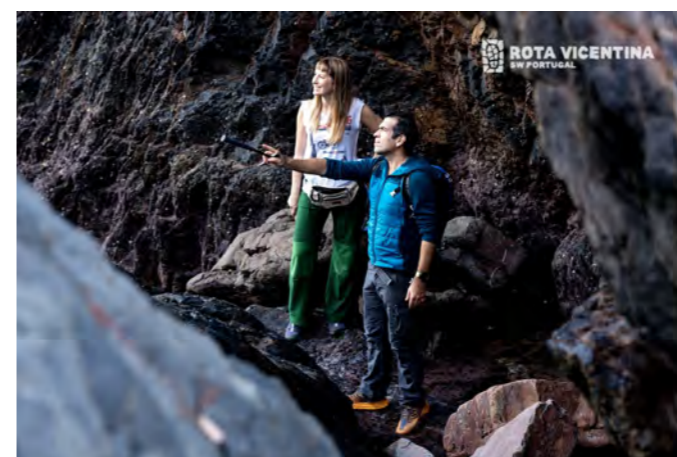
Pedestrian Trail