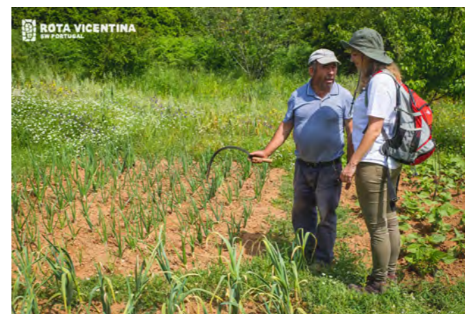
Agriculture