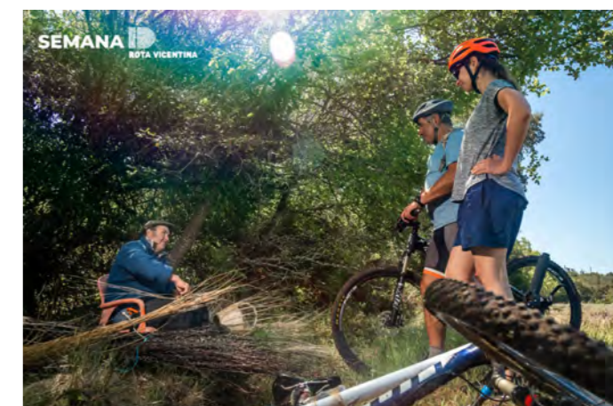
Bikers