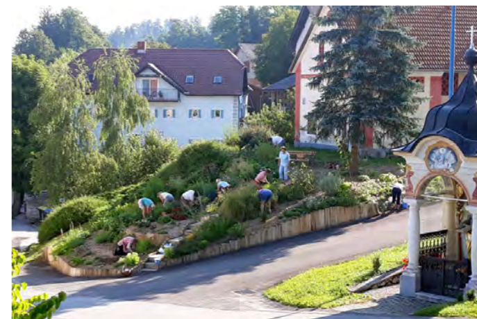
Summer gardening in the village garden