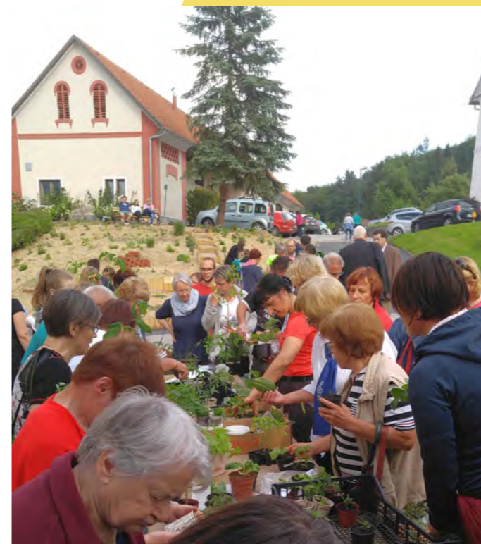
An exchange of seedlings in the village square

The project has achieved its target to a large extent. Thanks to the garden, old sorts of cultural plants, knowledge and traditions of the region have been preserved. Moreover, residents meet in or around the garden and arrange it. More and more people come to the garden to relax, learn, and there are also many visitors from other places. An annual festival of exchanging seedlings is of benefit to not only the local community but also beyond. If there are no economic benefits, all participants gain knowledge about the traditional ways of growing plants as well as new approaches to it (e.g. permaculture). Moreover it keeps the intangible cultural heritage of Smlednik alive. The project was well accepted in the community, and it has been presented in local and national newspapers in Slovenia.