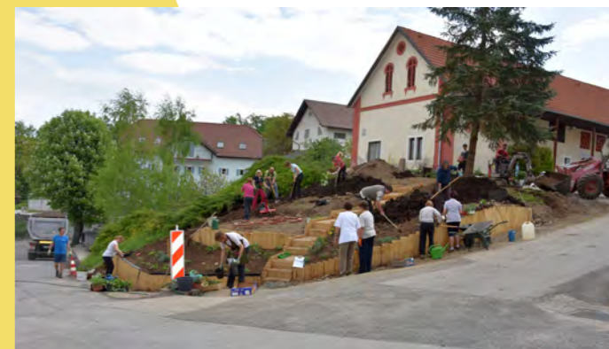
Designing and building the village garden following the principle of community gardens ©Spela Rakun, Društvo za ustno zgodovino