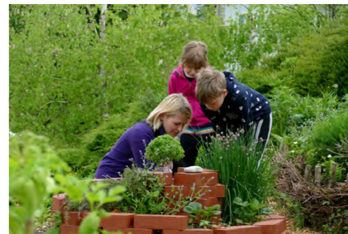
Children's workshop on learning about plants