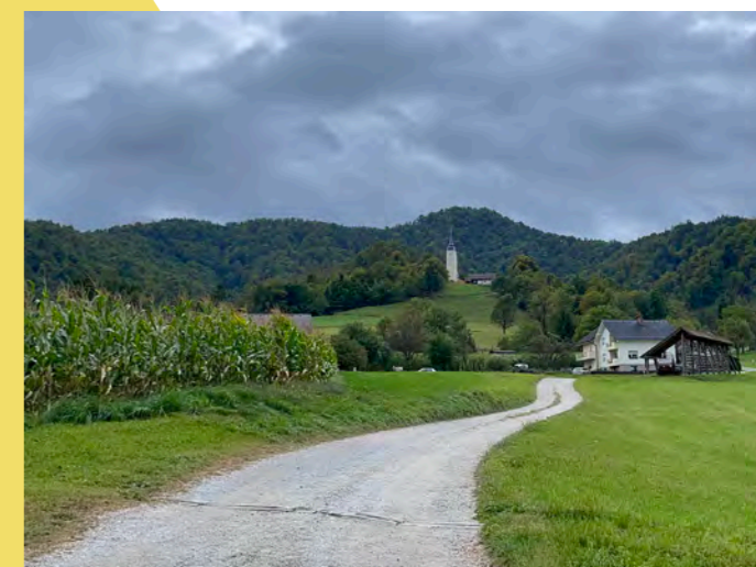
View from the road below the hill