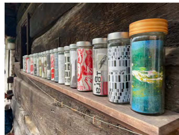
Pots that are part of the hiking participatory artwork