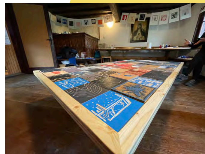
MIZA table

Despite some difficulties at the beginning, the project has become a landmark for the cultural life in the area. The achievement is shown by the fact that the project has been renewed every year for 7 years. The artists succeeded in involving visitors in activities and making them aware of the heritage of the settlement and of contemporary art production. The local community seems to be the main beneficiary because it benefited from the access of art and culture, learned more about their traditions but the activities were a way to socialize too. Although the first creative work was ambiguously perceived by the local community, the project is now accepted and the local community, especially local pupils.