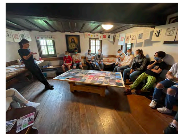
Children in main house