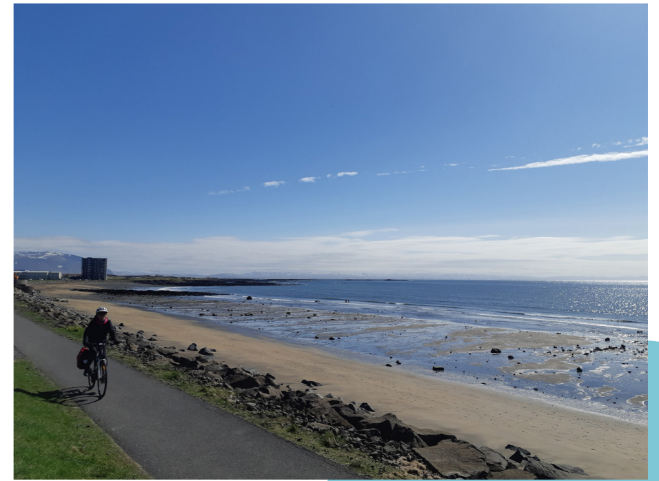
Seaside walkpath

The project reached its two main targets. In fact, this public space has become a landmark in Akranes for outdoor activities and the municipality has attracted more and more tourists. This is particularly striking since the implementation of the pool Guðlaug which attracted 30.000 visitors in 2018. With this reinforced touristic attraction and these new public facilities, it seems obvious that the local community is the main beneficiary of the project. As written in the papers Akranes.is and Skessuhorn.is, locals are generally happy with it (especially the geothermal pool) and some are fascinated by Langisandur and think of it as one of Akranes' pearls.