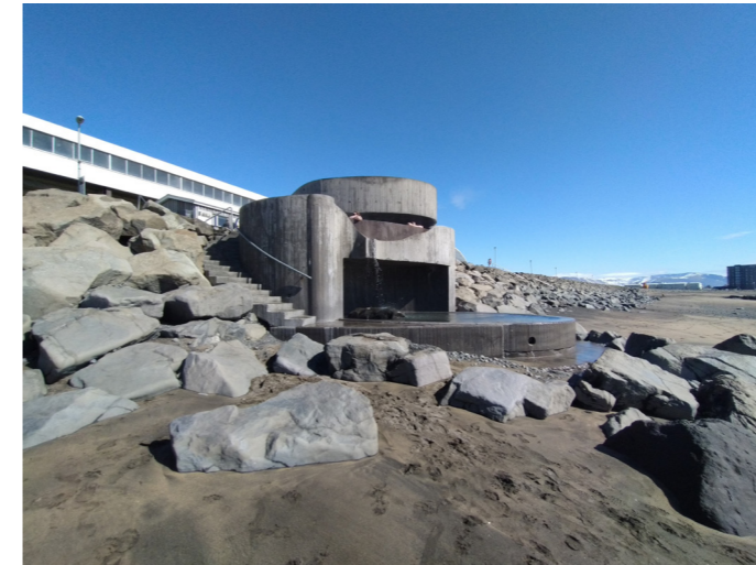
Artificial beach pools