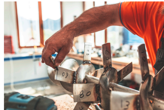
Construction ©Tzoumakers – photo by Nicolas Garnier, Creative Commons licence