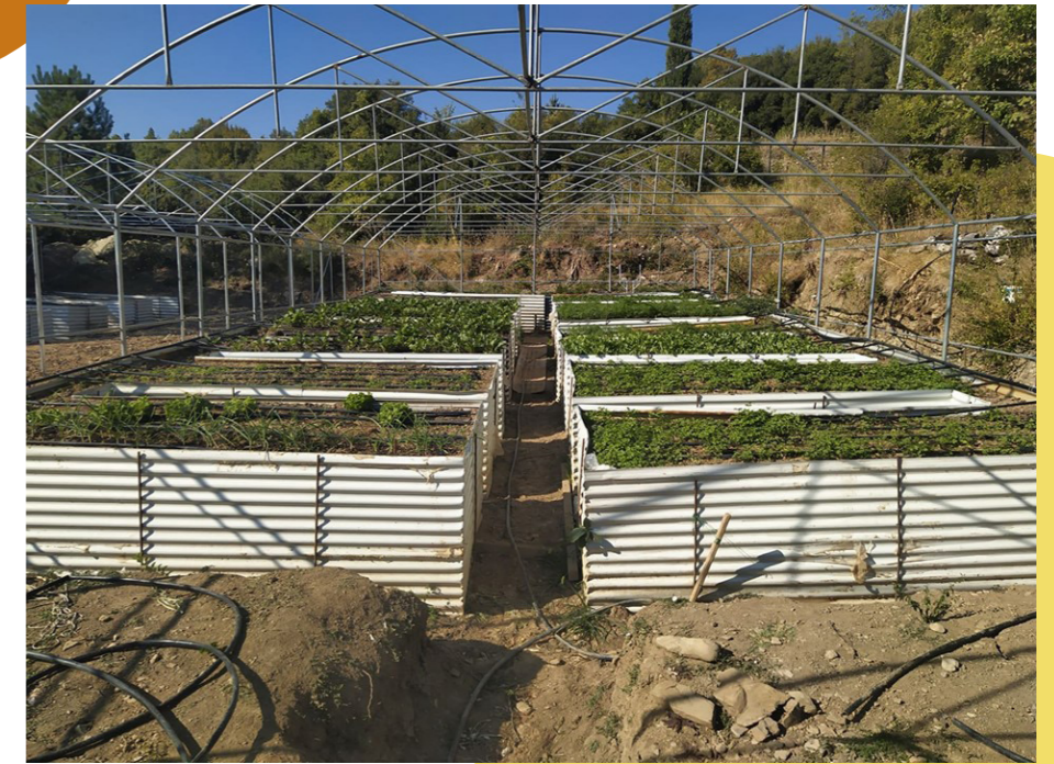
“The high mountains” space 2 ©The high mountains – photo by Sotiris Tsoukarelis