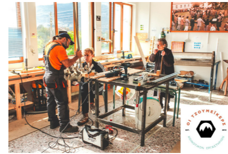
“Tzoumakers” space ©Tzoumakers – photo by Nicolas Garnier, Creative Commons licence)

These projects are the result of citizen initiatives. For instance, the social cooperative of The High