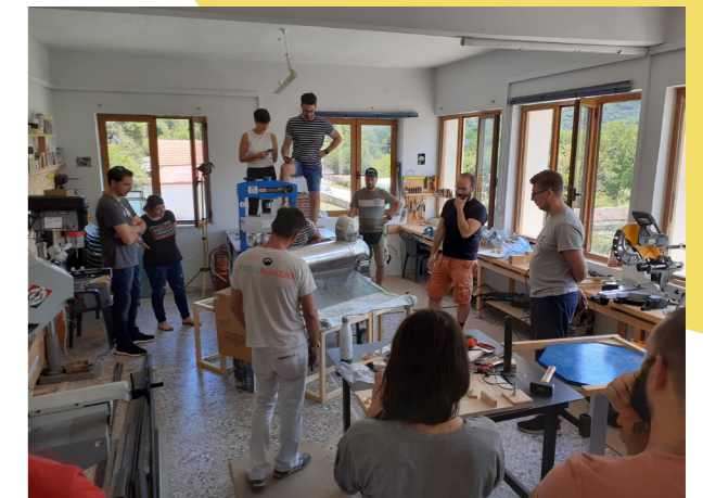
Testing the grinder for aromatic plantsw