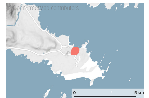
Djúpivogur, Municipality of Múlaþing, Iceland