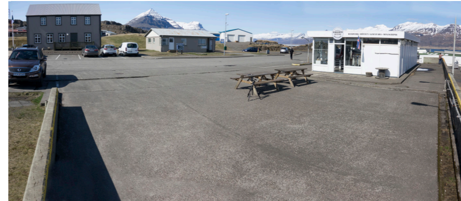
View before intervention B1

The project was initiated by the municipality of Djúpivogur in order to have better urban planning in