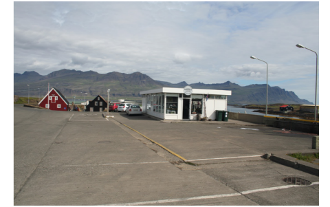
Kallabakki before the change