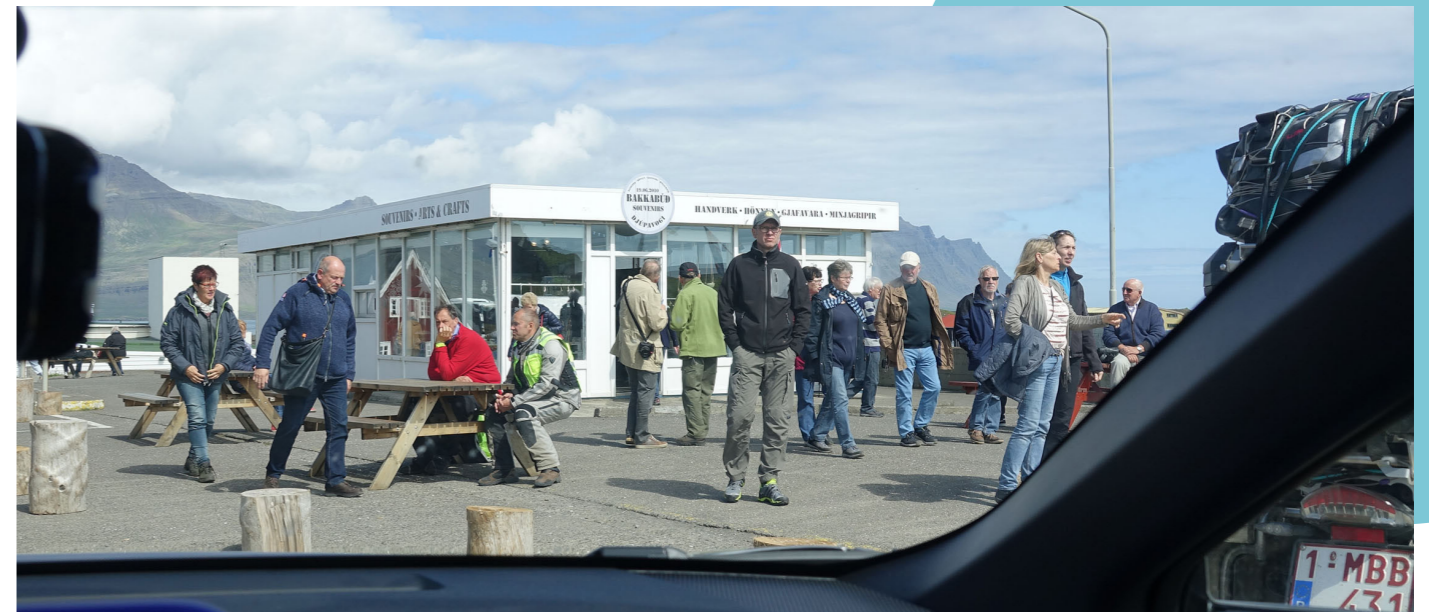
Kallabakki full of people