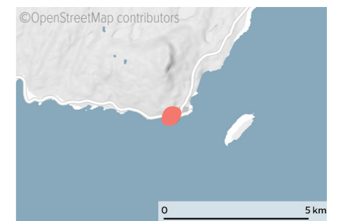
Drangsnæs, Westfjords, Iceland