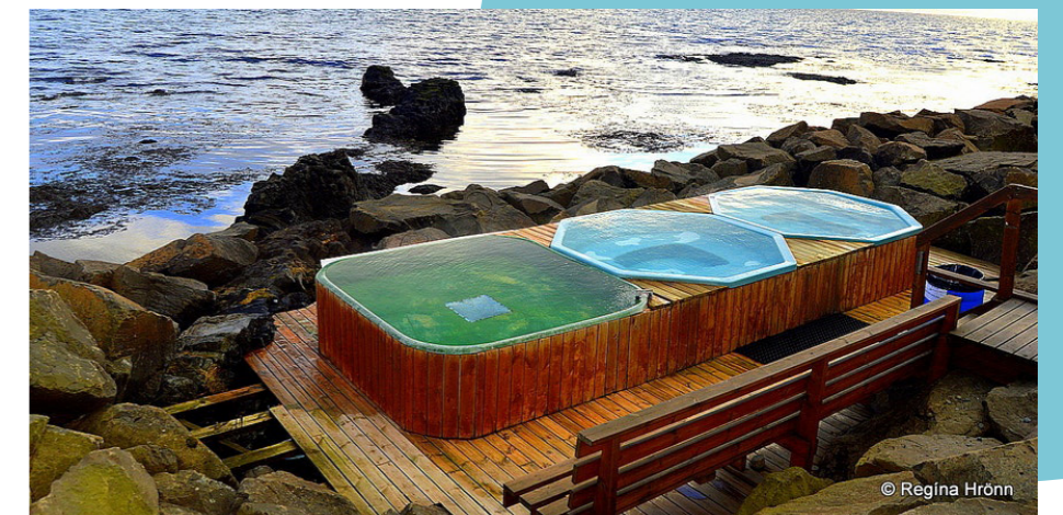
The hot pots