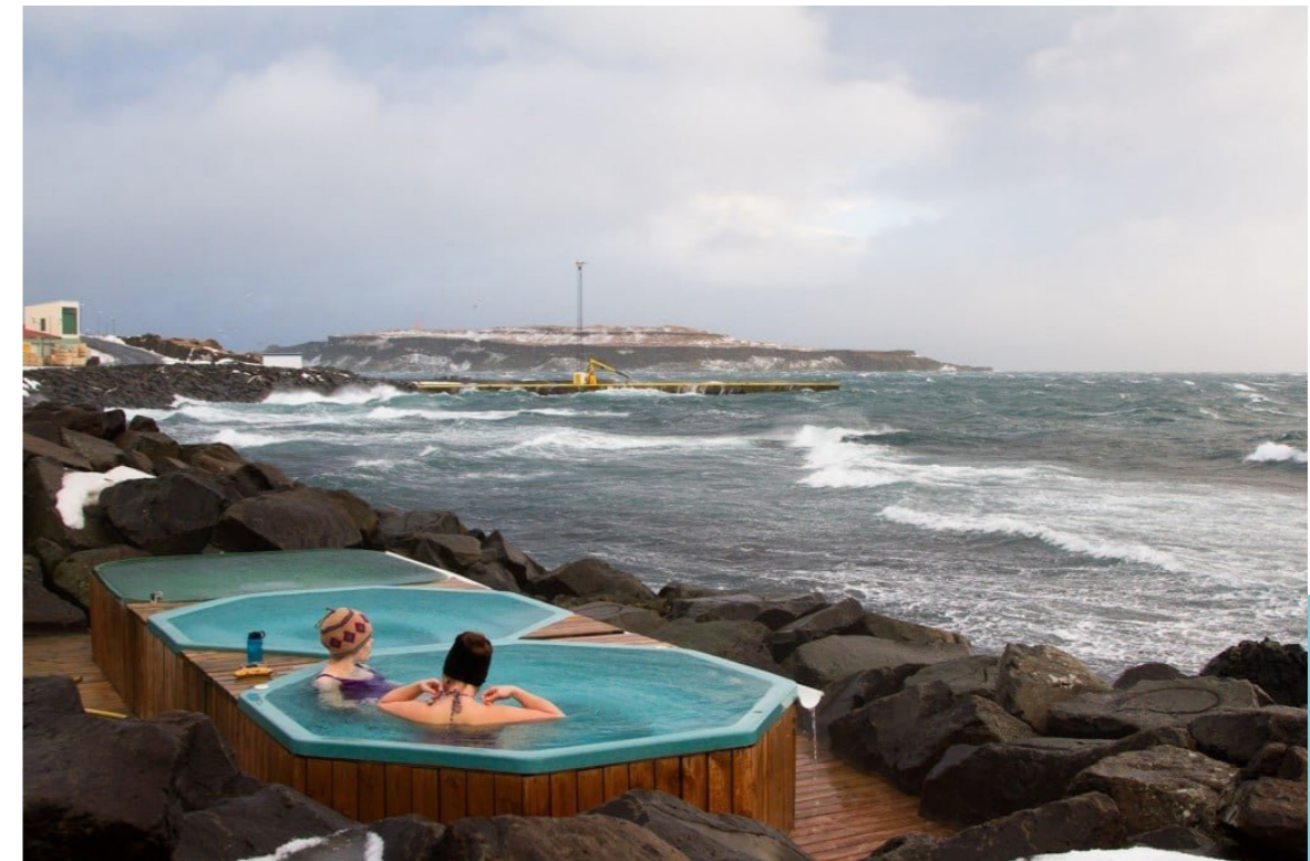
People in the hot pots on a windy day

With almost 25 years of hindsight, it seems that the project has exceeded its initial goals which were to make use of the hot water and create a pleasant place in the village. The “Hot Tub Trio” has indeed brought the community closer, attracted visitors and encouraged communication between tourists and locals. Consequently, there are numerous beneficiaries of the project, from the local fishermen, who can enjoy the tubs after they come home from the sea, to the local businesses which have benefited from the increased attractiveness of the village.