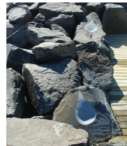
Part of the artwork which is embedded in the surrounding rocks_Samper Mireya ©Mireya Samper - photo by Júlí