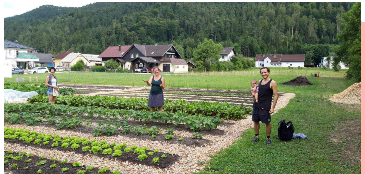
Biologically dynamic vegetables from the garden farm are used in the kitchen of the Dorfschmiede.