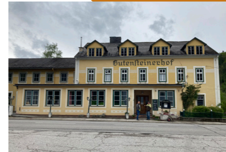
Graz Dorfschmiede