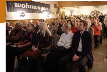
An information event in the rooms of the Dorfschmiede