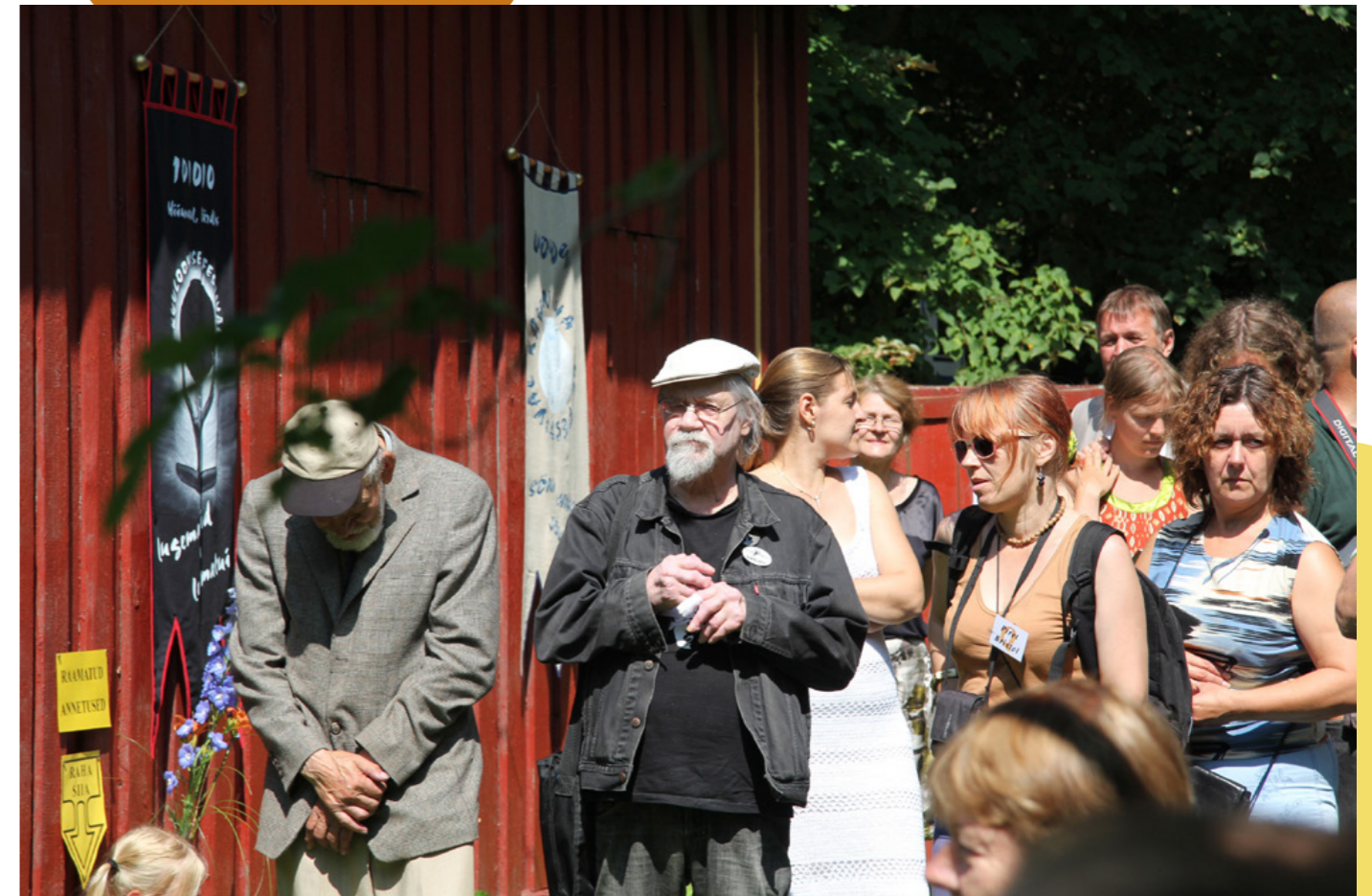
Poetry festival

Ave Vita! project was founded and is managed by famous Estonian writer Ave Alavainu. Her motivation was to raise cultural awareness