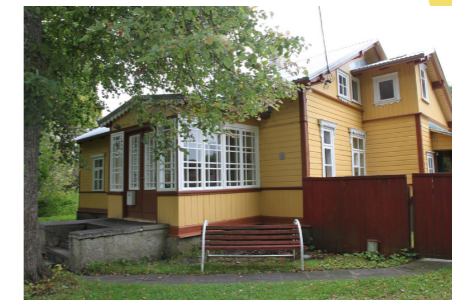
Ave Vita! Centre for cultural activities