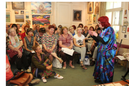
Gathering of Estonian language teachers