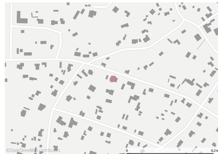
0 0,2 km