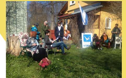
Garden party