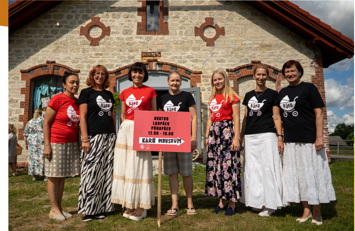
Käru Museum Open Day

The Käru Museum of Good Deeds seems to have reached its aims, although a lot is to be done according to the initiators. Through effective inclusive work, a number of local people have already been reached to volunteer to keep the museum running. This new landmark in Käru has become a gathering place for locals who are clearly the main beneficiaries of the project. The initiative is thus well received by them, especially by active community members. The museum has a strong binding effect on the whole community and is an inspiration to many. An increasing number of them are also ready to take part in the work of the museum, and there has been significant growth in this aspect.