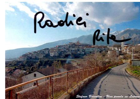
Stefano Boccacini's postcard sent to collect the words for Latronico. ©Stefano Boccacini, Una parola su Latronico, 2011