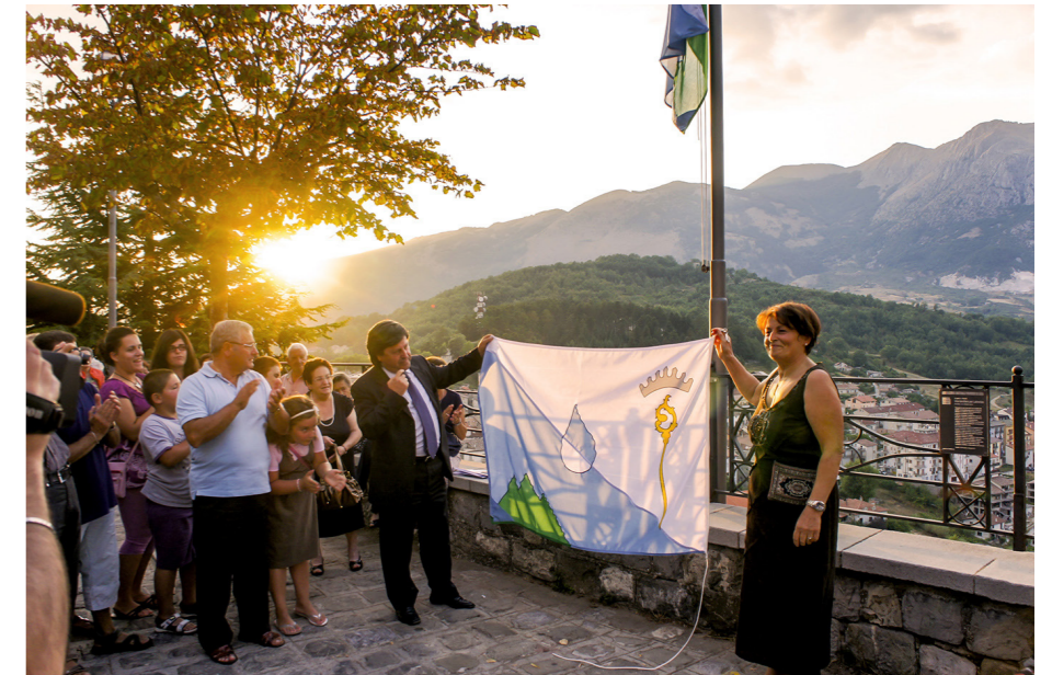
The raising of the winning flag in Largo Eleonora Pimentel in Latronico