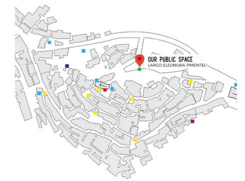
Map of "A Cielo Aperto" permanent works with the focus on the place where Latronico Flag has been displayed. ©Pasquale Campanella