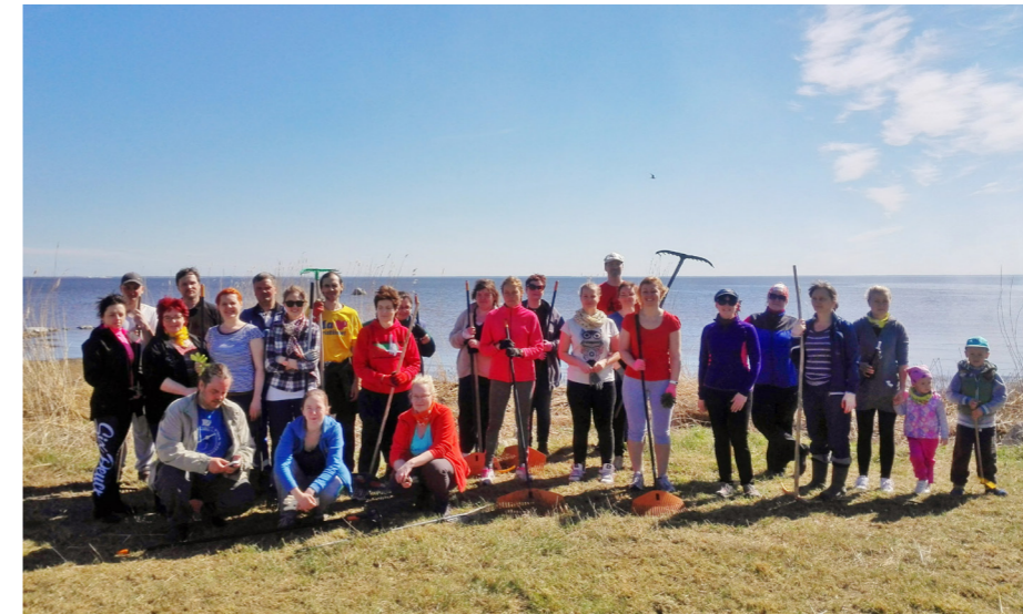
Joint activity

The project started in 2003 by the initiative of Taavi Tamberg. In the beginning there was no support, but since the direction of the community center was led to local