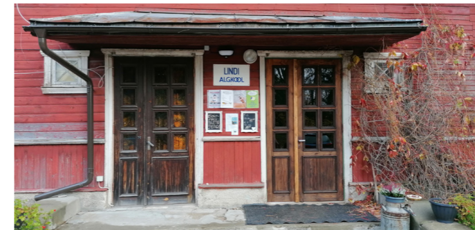
Sign of old elementary school, now a village society