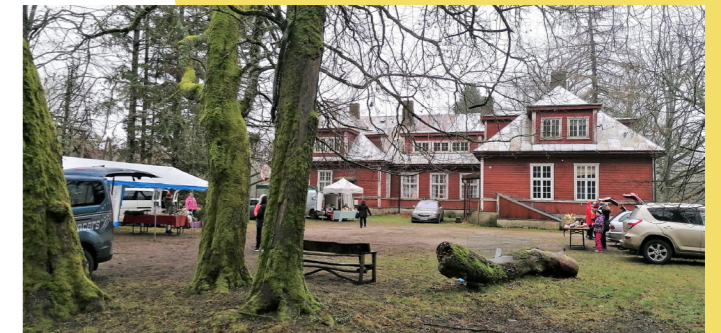
Old school, now a community center/village society