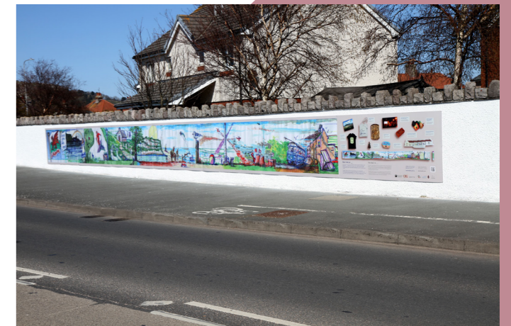
Final wall artwork installed ©Kristin Luke