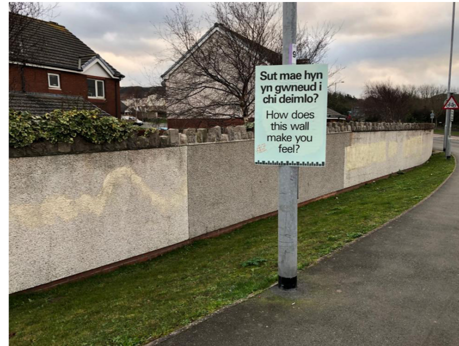
Interactive walking tour around estate

In addition to general support, advice and guidance from community organisations such