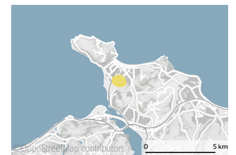
Llandudno, Wales, United Kingdom - Wales