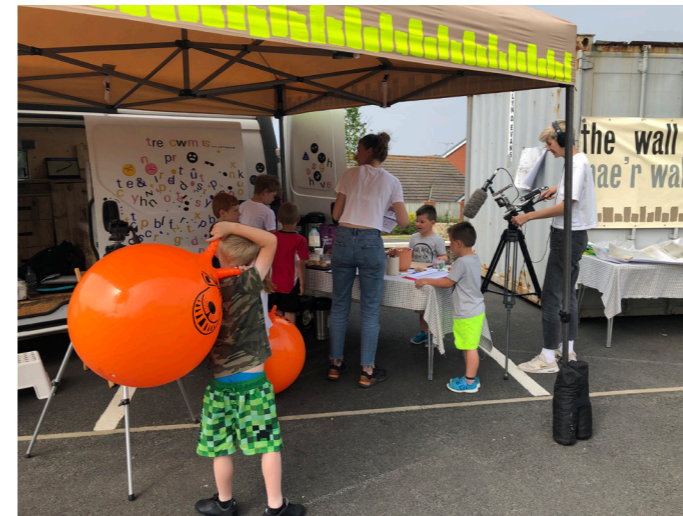
Getting to know you van stops