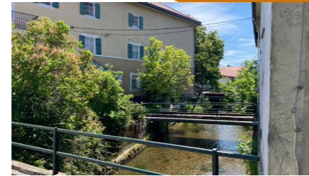
A new restaurant has moved into the old inn.