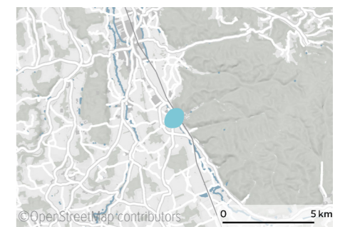
Munderfing, Upper Austria