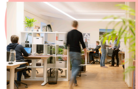
The new co-working space.