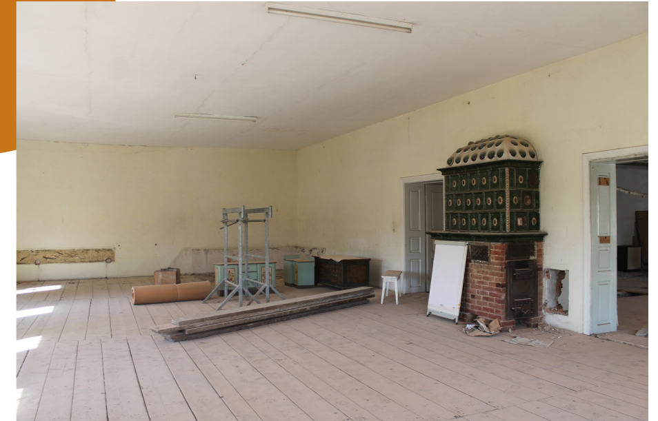
Transformation of the old vacant inn into a co-working space.