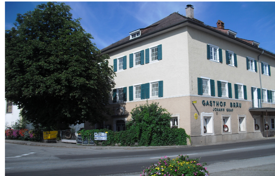
The Braeu, a formerly vacant inn that now houses a restaurant, co-working space and seminar house.