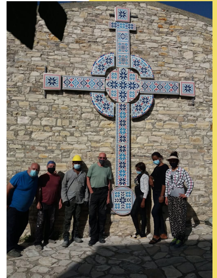
Church with a cross bearing the 'lefkatiotika' lace patterns