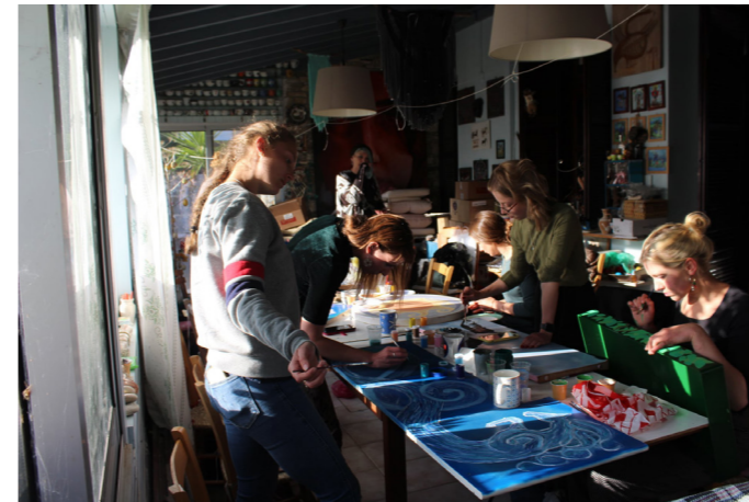
Painting lessons

The project consists of educational activities led by Grampus in the framework of Green Village partnership in cooperation with other European rural settlements. The local community is involved as the host of those who wish to participate in the local creative workshops. Their culture and their place is in the center of the creative process: local community learn from their ancestors . In addition, many local residents play the role of teacher for the education in archeology and crafts. The municipality has been very keen to support the process and the