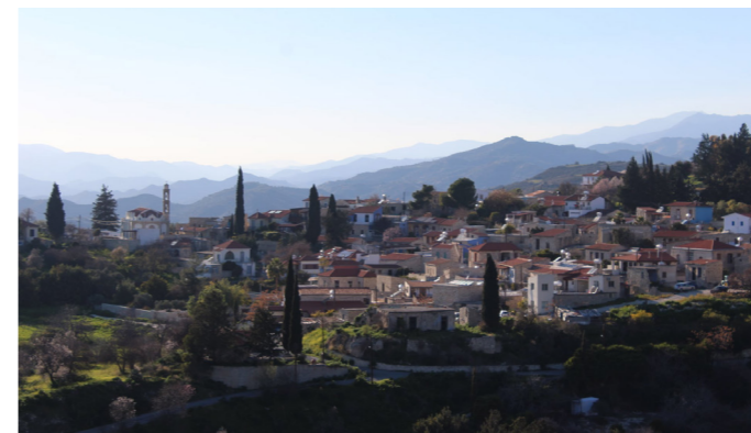
Overview of the village