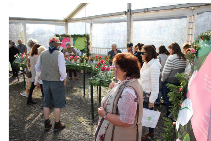
Mostra de Camélias