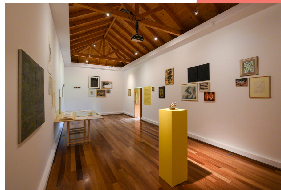
Exhibition project ©Quinta Pedagógica dos Prazeres

The Quinta Pedagogica dos Prazeres integrates four different areas: the farming area which advocates alternative cultures, the transformation area where they prepare homemade jams, cakes and medicinal herbs, the animals' area where you can interact with different species and, finally, a