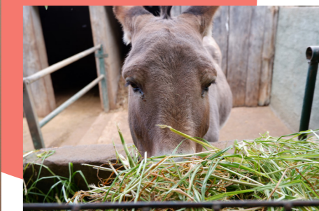
Quinta Pedagógica dos Prazeres