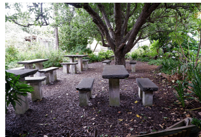
Quinta Pedagógica dos Prazeres