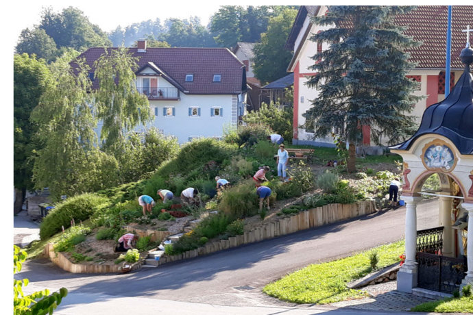
Summer gardening in the village garden