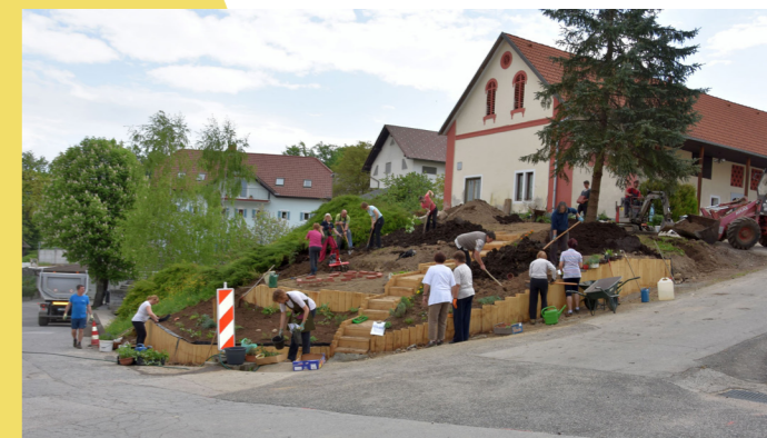
Designing and building the village garden following the principle of community gardens