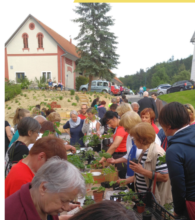
An exchange of seedlings in the village square

The project has achieved its target to a large extent. Thanks to the garden, old sorts of cultural plants, knowledge and traditions of the region have been preserved. Moreover, residents meet in or around the garden and arrange it. More and more people come to the garden to relax, learn, and there are also many visitors from other places. An annual festival of exchanging seedlings is of benefit to not only the local community but also beyond. If there are no economic benefits, all participants gain knowledge about the traditional ways of growing plants as well as new approaches to it (e.g. permaculture). Moreover it keeps the intangible cultural heritage of Smlednik alive. The project was well accepted in the community, and it has been presented in local and national newspapers in Slovenia.