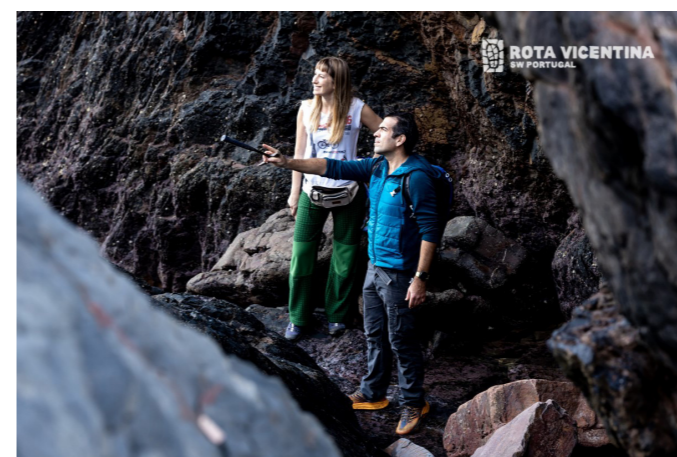
Pedestrian Trail