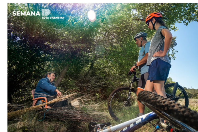
Bikers