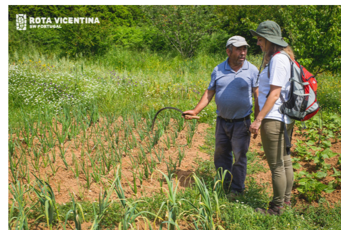
Agriculture