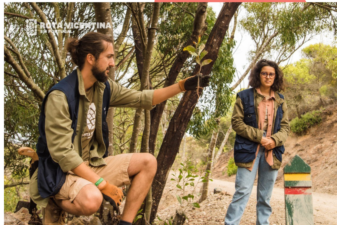
Forest guards

The targeted impact was and is still being achieved. It is an ongoing process that requires constant action and initiative from the local communities, the partners and the project itself. Here, the main beneficiaries remain the local community, local businesses, the project partners and the territory that supports all these activities. Considering the positive impact on the communities and the growing interest in the project by either the Portuguese population or the foreign population as well, it is safe to conclude the reactions of the general public were not only positive, but were indeed very satisfactory.