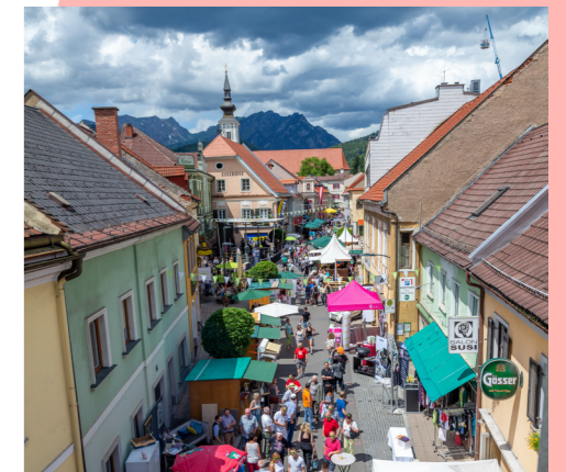
Since 2016, Trofaiach has held an annual street festival in the Main Street.