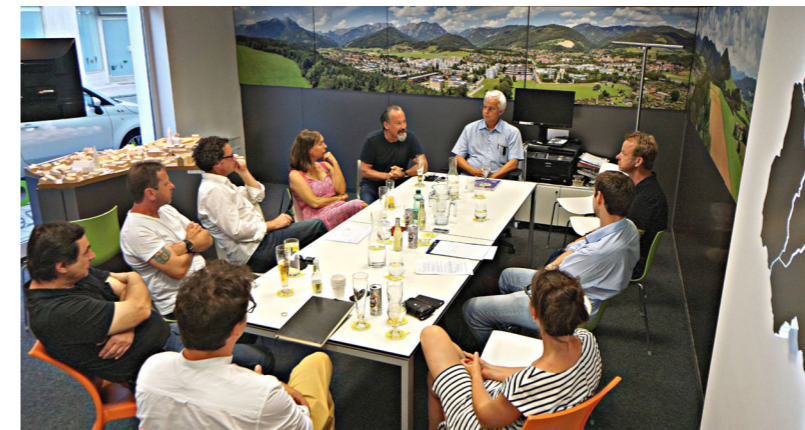
Participation meeting with nonconform, citizens and community representatives.