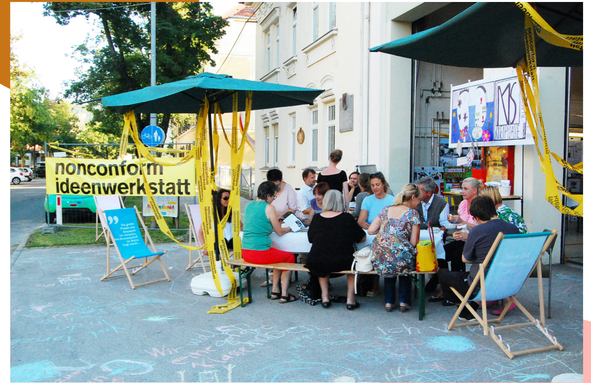
One of the many workshops conducted by nonconform with the residents.

Nonconform organized workshops with 1000 citizens from different backgrounds about 10 topics. Afterwards, interested people were assigned to specific topics and met regularly. Given the fact that the activities are still ongoing, the population is continuously involved. From these workshops and meetings, many projects have emerged. One of the most relevant is the visual upgrading of the main street where, with support of the municipality, homeowners renovated their buildings and especially their facades. The town provides 100 000 euros annually for activities related to the upgrading of the main street and vacancy